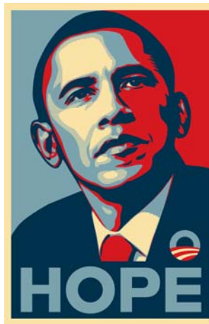
Obama Hope Poster

143. Upon information and belief, by misrepresenting the true source of the Infringing Works, Plaintiffs have engaged in a misguided effort to argue that Fairey made more substantial changes to the photograph — i.e., that he at least had to crop it — than he actually did. But a simple comparison of the Clooney Photo to the Infringing Works and the Obama Photo make clear to even the casual observer that Fairey used the Obama Photo, depicting President Obama sitting alone, as the basis for the Infringing Works. Moreover, it has been widely reported that third-party image recognition software has been used to determine that the Obama Photo was indeed the photo which Fairey used. Unlike the Clooney Photo, both the Obama Photo and the Infringing Works depict exactly the same close-up of President Obama, tightly framed with his head tilted at the same angle, with the same expression on his face and the same focus of his eyes, along with the same lighting and shading. Significantly, in both the Obama Photo and the Infringing Works, Mr. Clooney is nowhere to be seen.