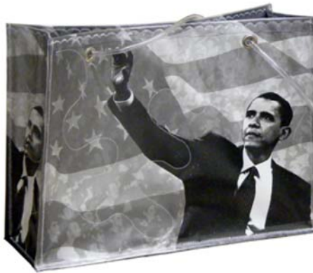
Licensed Derivative Work

93. The AP is not unique in licensing images for use in advertising, artistic works and merchandise, including on tote bags, T-shirts, posters, prints, banners and the like. The talent, skill and effort required to create compelling still images has fostered a vibrant market for professional photography, one on which many photographers have come to rely for their livelihoods. In addition, many content providers, whether news or entertainment in nature, rely on this revenue to support their activities. The AP's licensing program not only allows it to continue operating its full scale, robust and dependable newsgathering services worldwide, but it enables The AP to pursue efforts protecting the First Amendment and guaranteeing public access to open government on the local, state and federal levels.