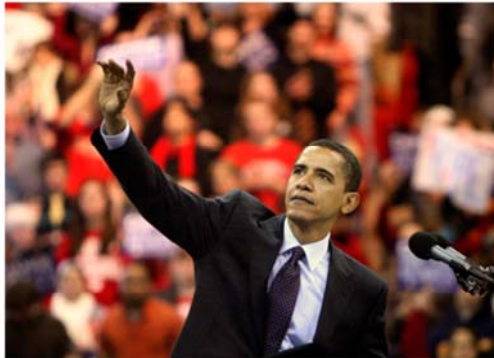
The AP Photo

For example, The AP licensed rights to a photograph of President Obama from its digital photo archive for use on a tote bag.