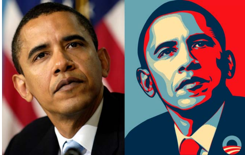
The AP's Obama Photo